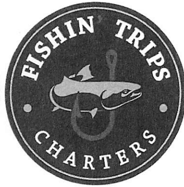
Six-Pack Charter Operators of Brookings, Oregon