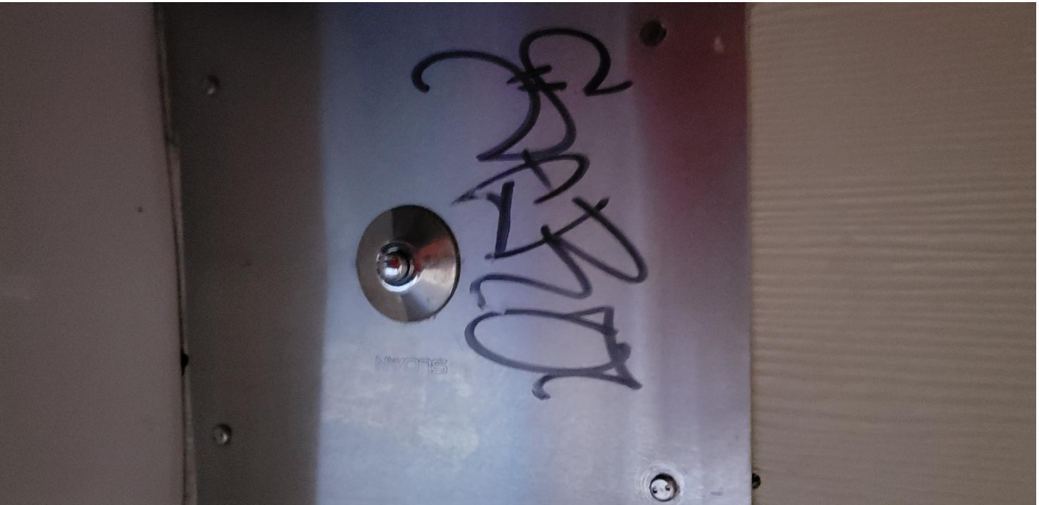
Skate Park Vandalism