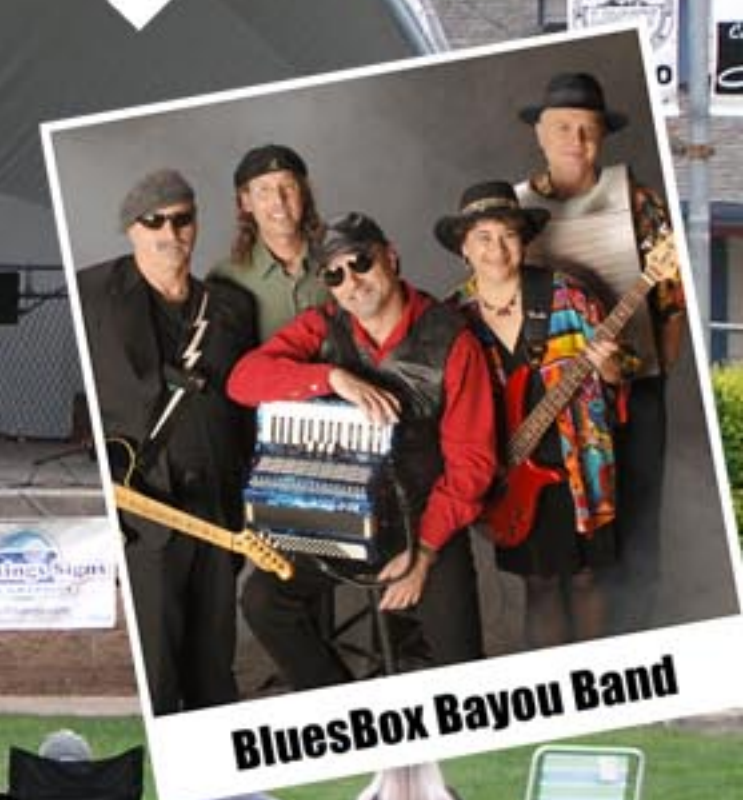
BluesBox Bayou Band