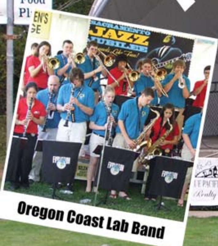
Oregon Coast Lab Band